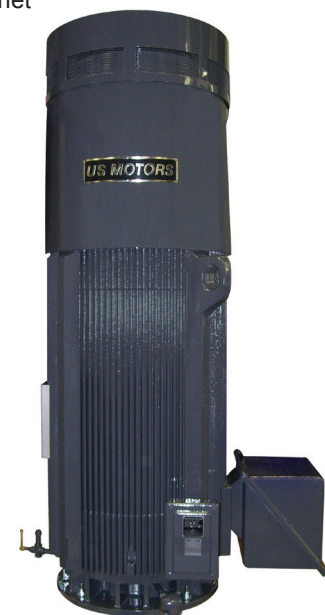
5812 Frame TITAN® II

† All marks shown within this document are properties of their respective owners.