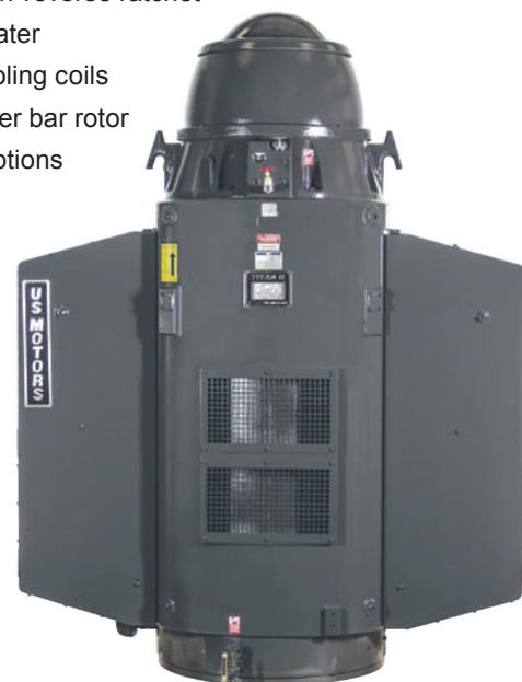
5813 Frame TITAN® II

† All marks shown within this document are properties of their respective owners.