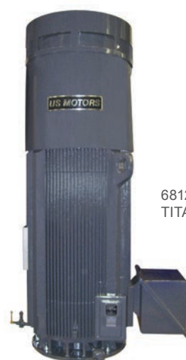
6812 vertical TITAN® II

† All marks shown within this document are properties of their respective owners.