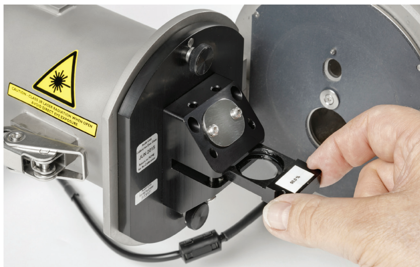
PCME QAL 360 shown with a multi-value Manual Audit Unit and attenuator

The automatic contamination check system (patent pending) ensures that any optical variances are measured, defined and adjusted to ensure zero and span drift is kept to a minimum.